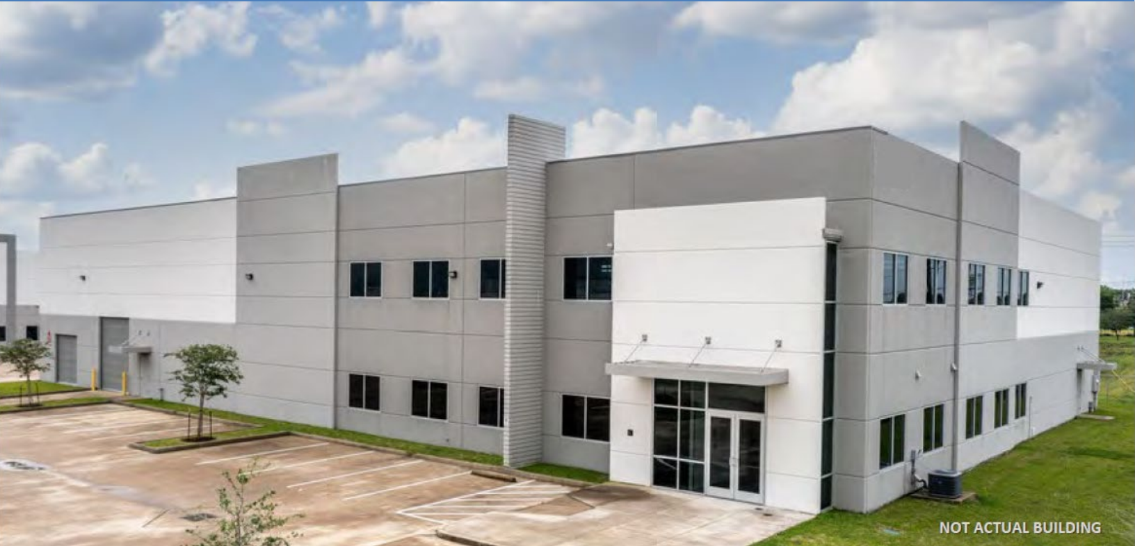
NOT ACTUAL BUILDING

11034 Bay Commerce Dr, Houston, Texas 77001