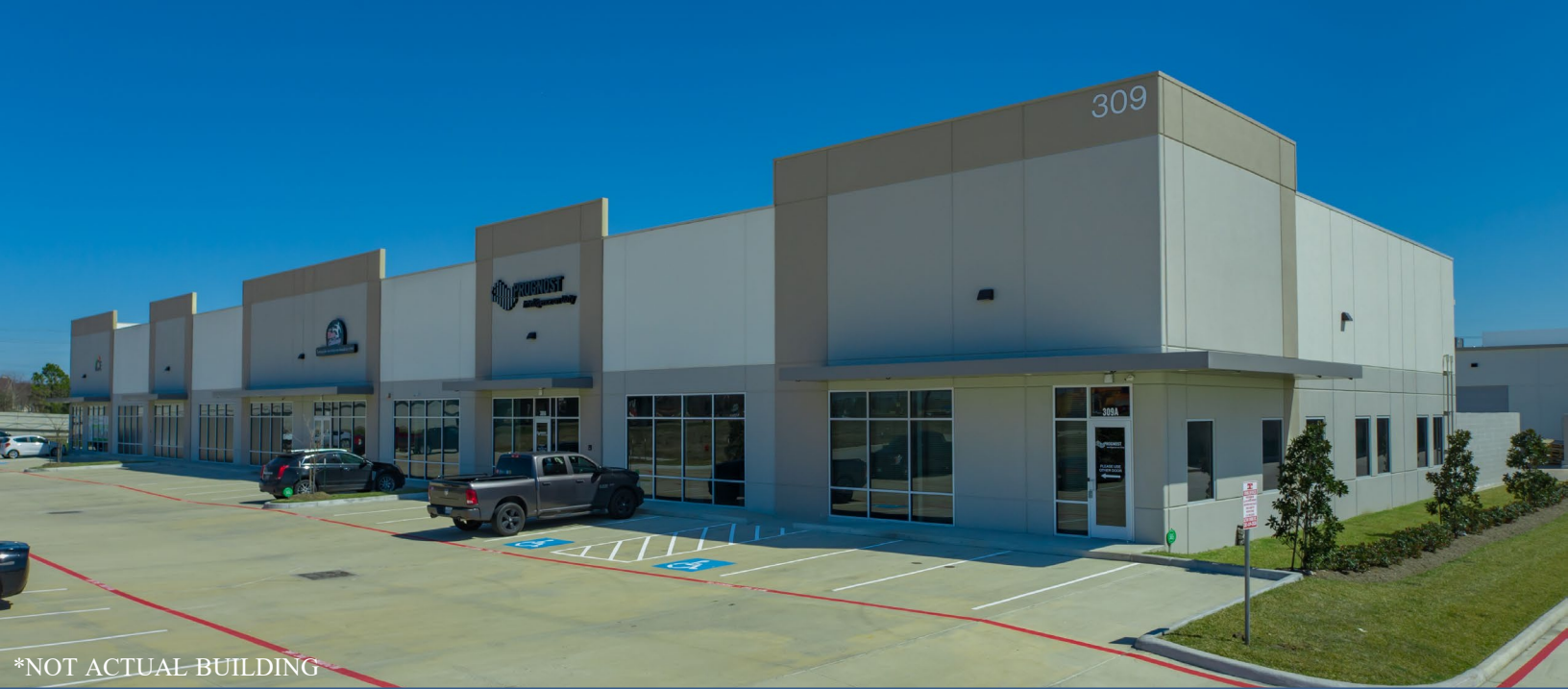
*NOT ACTUAL BUILDING