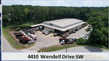
4410 Wendell Drive SW