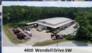
4410 Wendell Drive SW